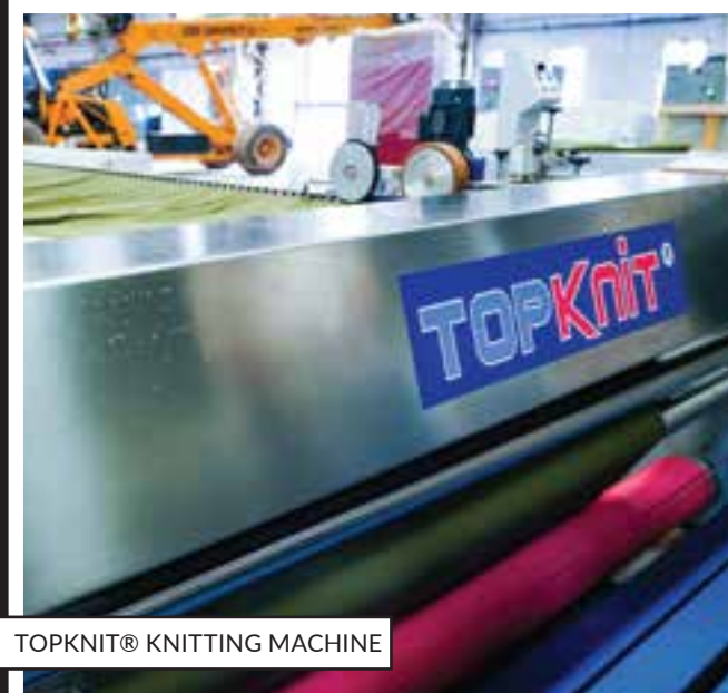
TOPKNIT® KNITTING MACHINE