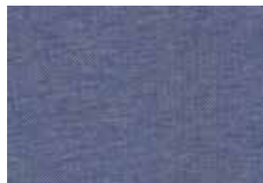
HIGH PERFORMANCE SYNTHETICS