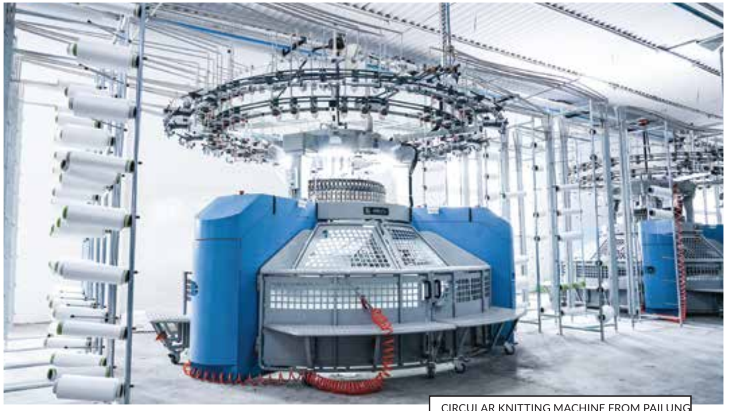
CIRCULAR KNITTING MACHINE FROM PAILUNG