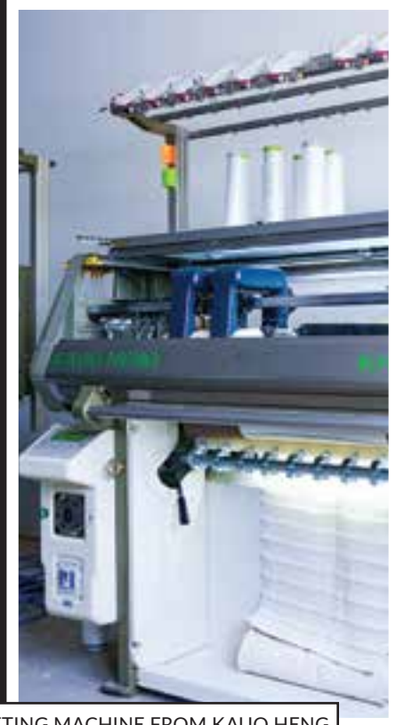
FLAT KNITTING MACHINE FROM KAOU HENG